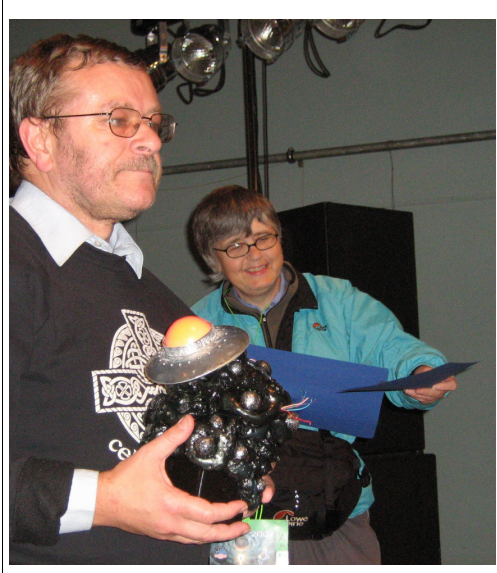
But what is this? Another spacecraft made of non-magnetic materials:

With the help of the scientists at the con they constructed this spacecraft magnet, and caught the invaders: