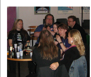
What are they drinking?